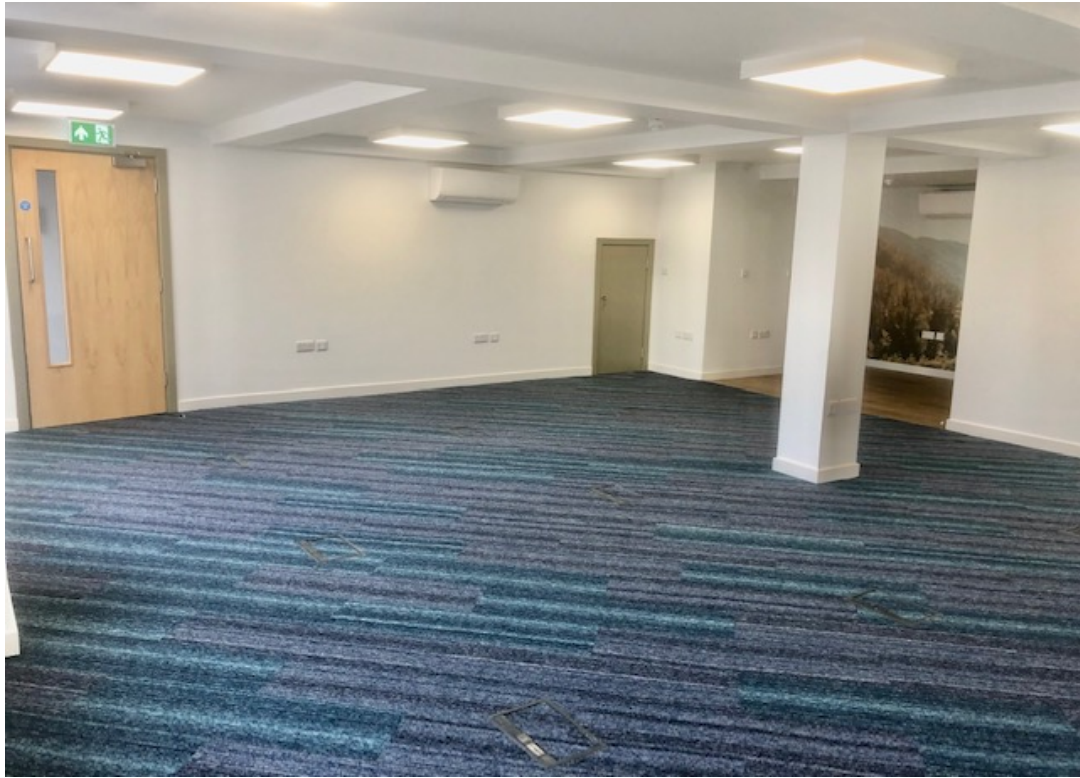
Both interior images of Unit 2 (top and below).